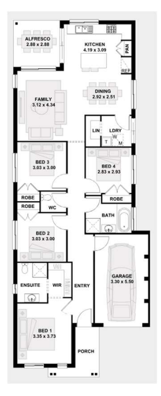
Land size: 300m2 Estate: The Hills of Carmel