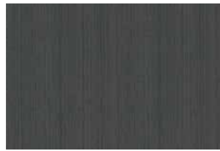
Cupboard Colour Melamine Cavia Lini Matt