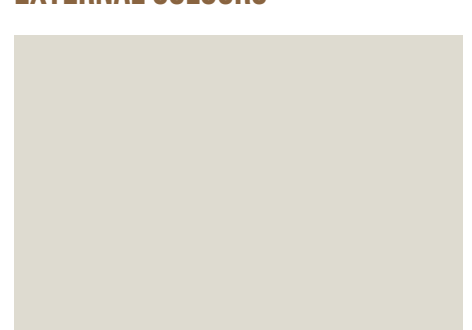
Double Storey: Cladding Dulux White Duck A216