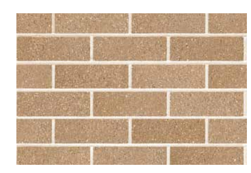
Bricks Austral Everyday Leisure (Off White Mortar, Ironed Joint)