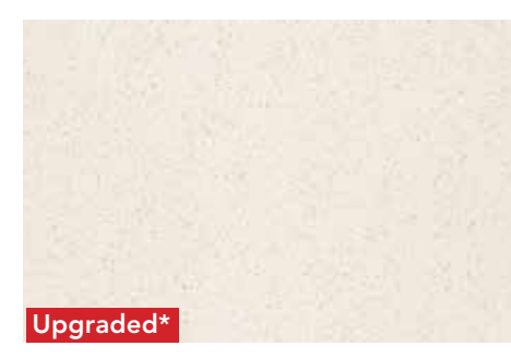
Caesarstone® Benchtop Ice Snow™