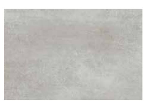
Main Floor and Wet Area Tiles Belga Grey (main floor - 450 x 450)* (wet area - 300 x 300)*