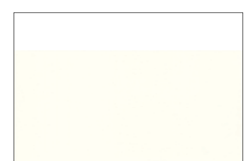
Wet Area Wall Tiles Sphere White Gloss (1221637)*